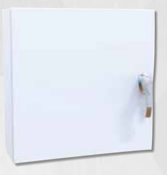
FINISHED IN SMOOTH RAL 9003 WHITE POWDER COATING INSIDE AND OUT