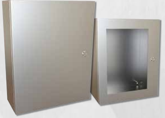
MANY SIZES AND WIDE RANGE OF ACCESSORIES AVAILABLE